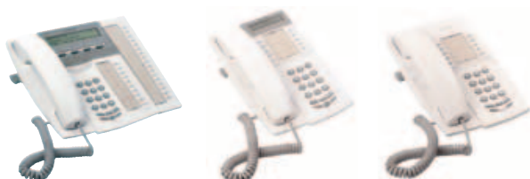
Dialog 4223 Professional